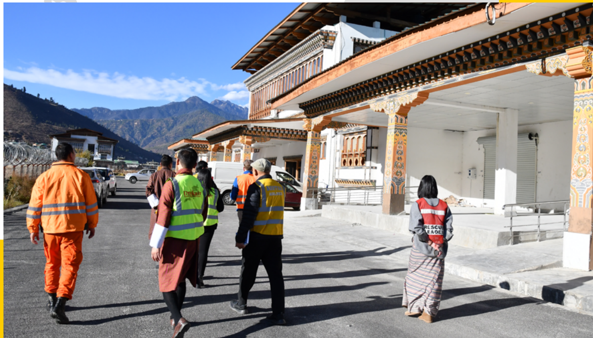
Airport walkabout to assess existing capacities at Paro International Airport (PBH), Bhutan.

The workshop yielded a set of impactful and actionable recommendations to propel Bhutan further along its journey towards sustained disaster resilience. National owners and partners of the GARD programme are now collaborating to integrate Paro International Airport into Bhutan's overarching disaster preparedness and response framework.