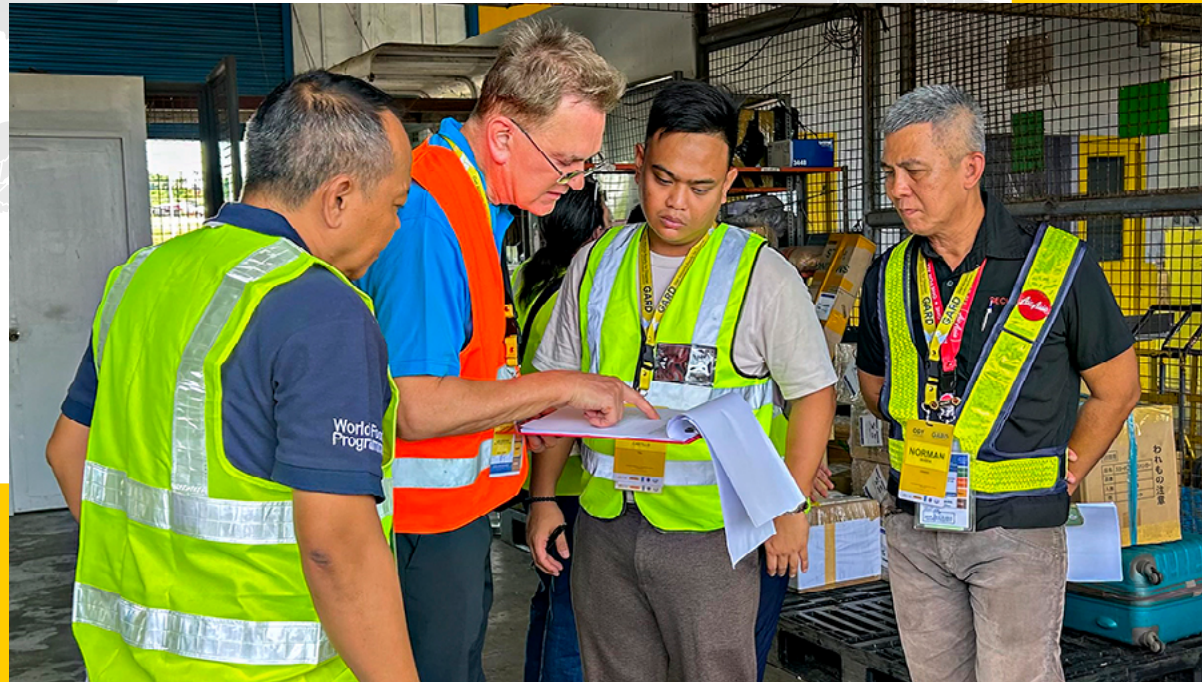
Participants are evaluating Laguindingan Airport's capacity to support a surge in humanitarian aid.

CAAP are confident that GARD will enhance their response efficiency and streamline the distribution of humanitarian aid during disasters. Consequently, UNDP and DHL Group are steadfastly collaborating with PDRF and CAAP to expand the implementation of GARD to additional airports nationwide in the coming years.