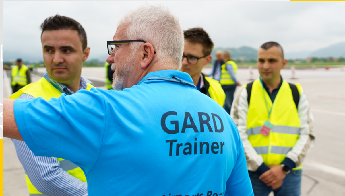
GARD Plus Workshop at Sarajevo International Airport, Bosnia and Herzegovina.

The GARD Plus workshop was conducted in partnership with the Disaster Preparedness and Prevention Initiative for South-Eastern Europe (DPPI-SEE) , an organization dedicated to regional cooperation and coordination in disaster preparedness and prevention, alongside the Ministry of Security of Bosnia and Herzegovina . Attended by local and national stakeholders, as well as disaster management professionals from seven of DPPI-SEE's member states across South-eastern Europe, the workshop laid the groundwork for the future replication of GARD at other airports throughout the region.